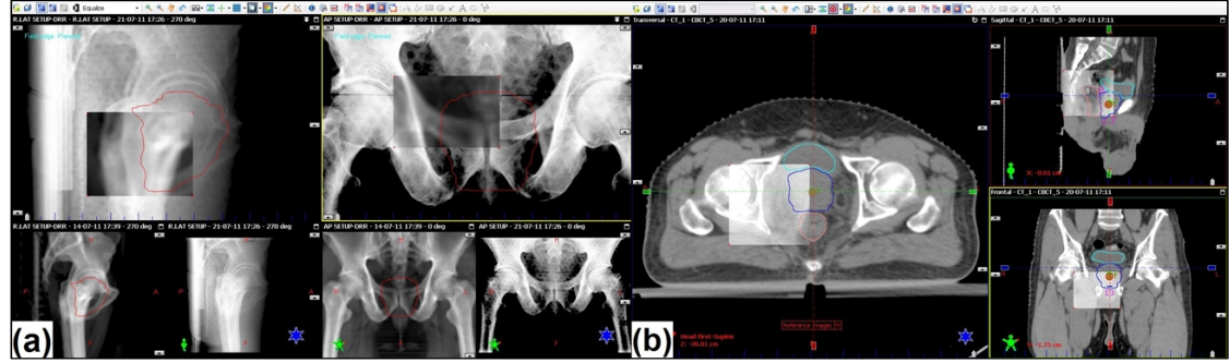
Figure 1: Registration window of the on-board imaging system (OBI) for (a) orthogonal portal imaging (OPI) and (b) cone beam computed tomography (CBCT).

the bones across the edges of the inner window. 13 The isocenter shifts along three translational directions, namely the lateral, longitudinal, and vertical directions, were noted and applied to the Clinac couch.